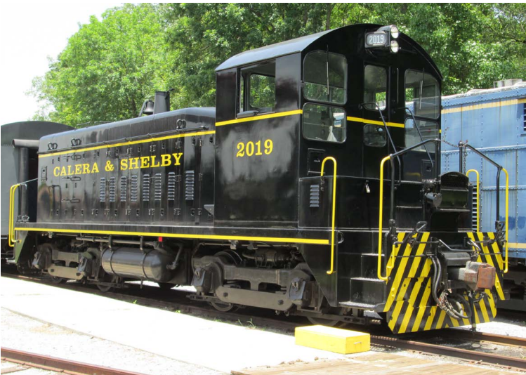
Former US Army SW8 2019, last serving with the 101st Airborne Screaming Eagles at Fort Campbell, KY, spends the Fourth of July 2015 still serving her country at the Heart of Dixie Railroad Museum in Calera, AL. A great home of one of the country's brave soldiers from the Korean Conflict.