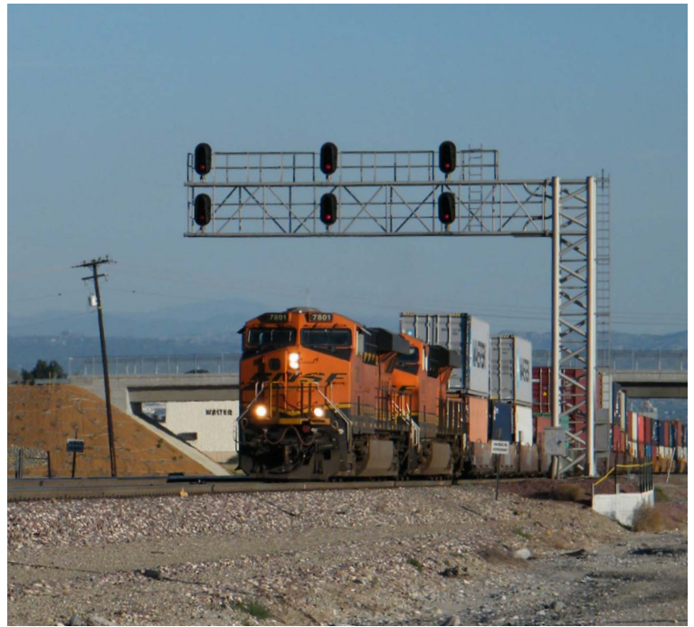
Above - BNSF ES44DC #7801 digs in as it leads its intermodal train north along Cajon Blvd north of San Bernardino, CA. on March 28, 2015.

Please note: All dates subject to change (with exception of meeting nights) until approved by the membership.