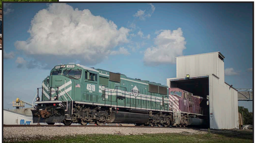
Right - Evansville Western Railway's 4519 leads its loaded coal train through the unloading bay at the Mount Vernon, Indiana coal transfer terminal. Tech Info: 1/2000sec, f/2.8, ISO 100, 56mm with a Nikon D800.