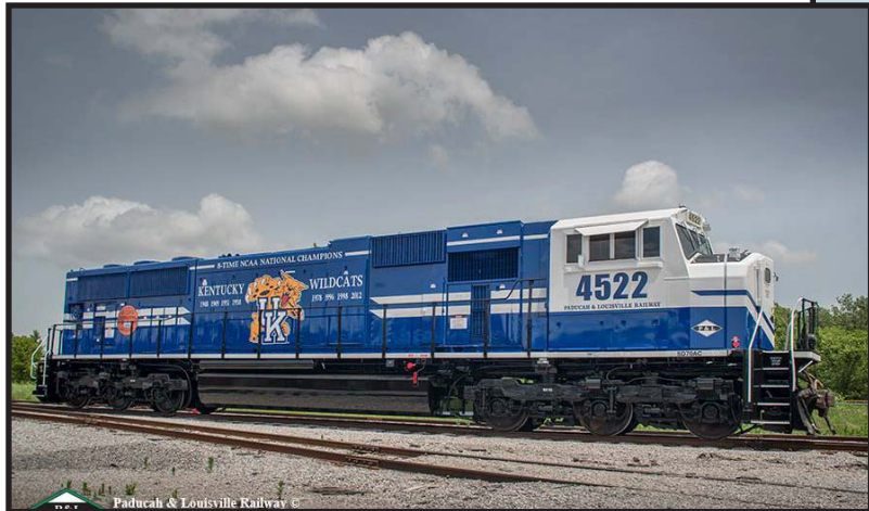
Left - Fresh out of the paint shop at NRE (National Railway Equipment Co.) in Paducah, Ky, Paducah and Louisville's engine 4522 sports a brand new UK paint scheme showing all the years that the University of Kentucky has won a NCAA National Championship. This is one of series of photographs I'll be doing for P&L over the next few months. Thanks to P&L for allowing me to share it with you. - Tech Info: 1 / 800sec, f/7, ISO 140, Lens: Sigma 24-70 @ 24mm with a Nikon D800 shot and processed in RAW.

PENNYRAIL is your publication. If you have photographs or other material of current or historical interest that you would like to share with Chapter members, your editor would appreciate hearing from you. Your material will receive the best of care while being readied for publication. Your help is appreciated.