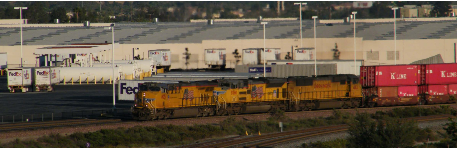
UP ES44AC #8051 leads its stack train, made up primarily of K-Line containers, towards Devore on BNSF trackage. UP's Palmdale cutoff are the tracks in the foreground. - Matt Gentry, 3/28/15