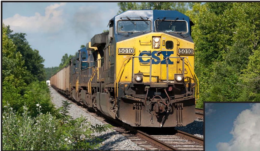
Left - CSX #5010 South is on the P&L with a loaded Coal Train that will head over to the Calvert City Coal Terminal later in the evening. But first he is taking the siding at the North End of Eureka, KY to tie the train down as the Terminal is not ready for him. 8/2/15.