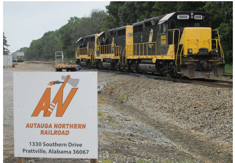
The Gulf Mobile & Ohio's Rebel Pride is alive and well on the southern portion of the railroad near Montgomery, AL. Three former GM&O GP35's, rebuilt by VMV Paducah in the 1990s for Burlington Northern, now work on G.M.&O track between Prattville, AL and Maplesville, AL. The trio is seen on the 4th of July 2015 at the headquarters of the line's new owner, Autauga Northern, a subsidiary of Webb Asset Management Group.